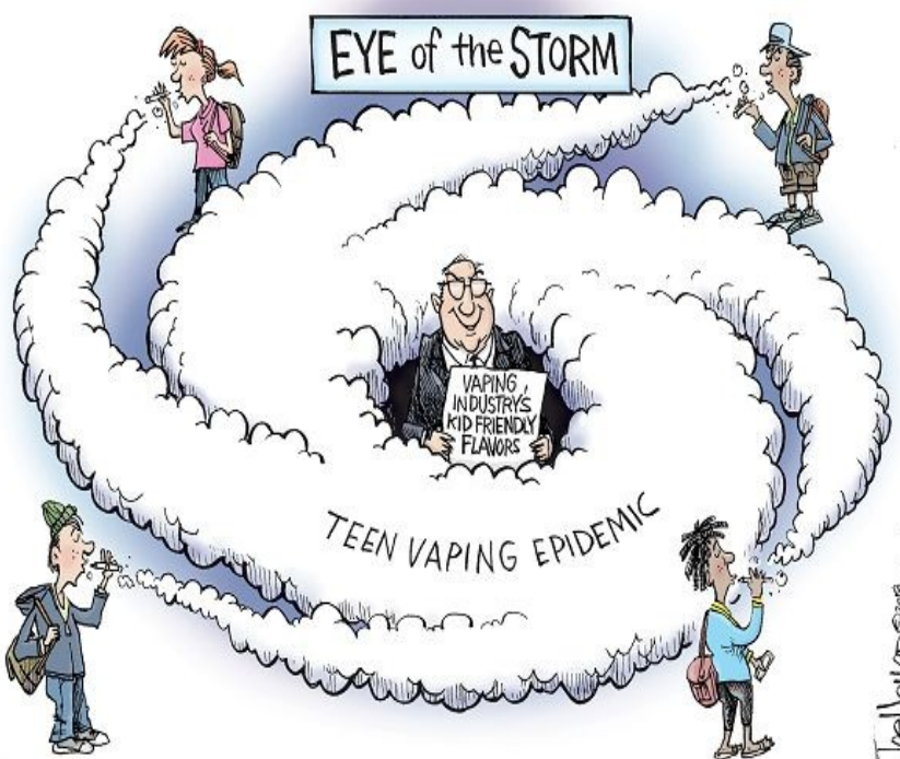
Joe Heller, Green Bay Press-Gazette