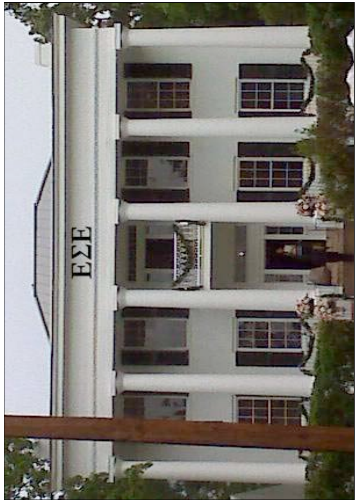
EXHIBIT 6: Photograph of the Epsilon Sigma Epsilon House