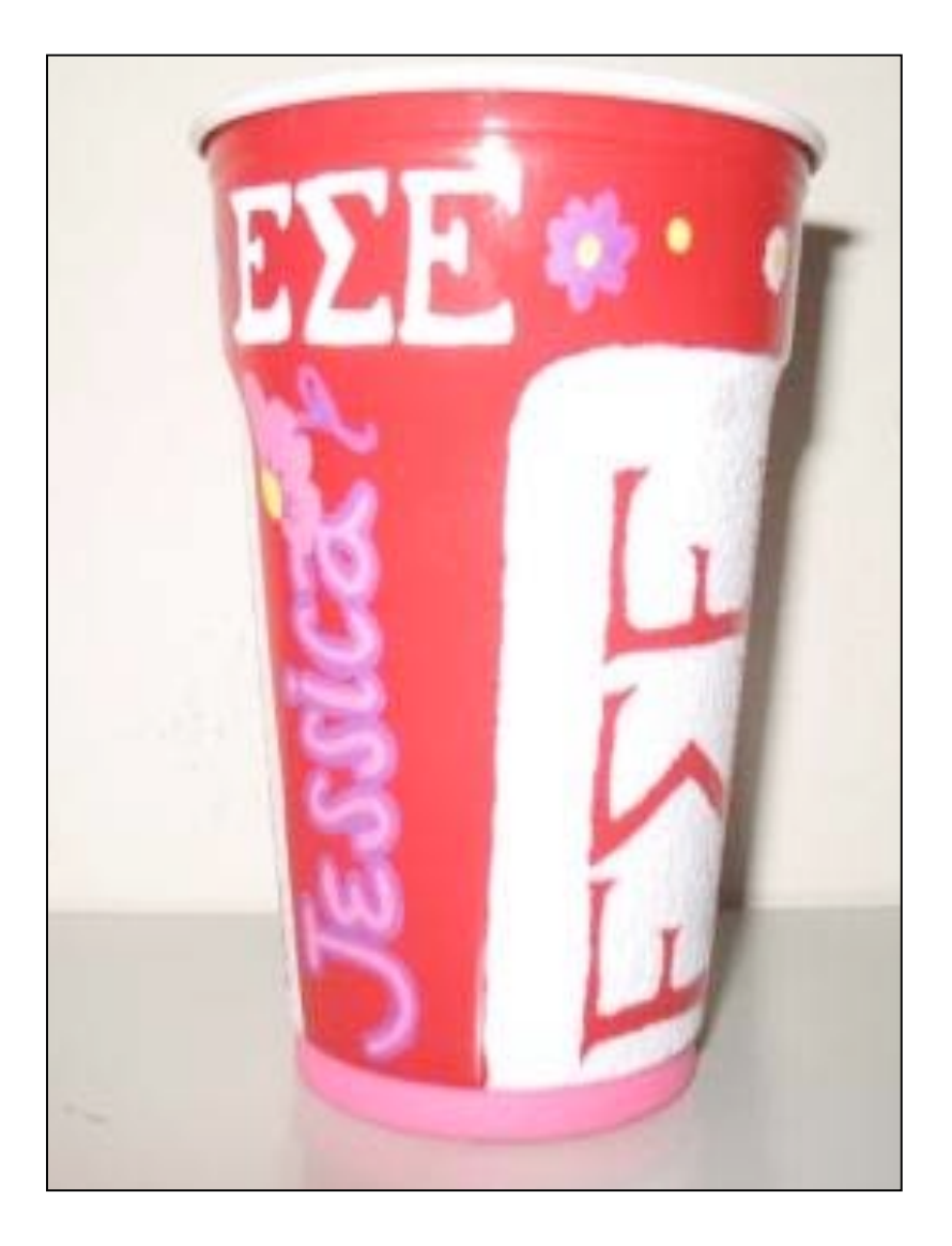
EXHIBIT 7: Photograph of Red Plastic 16oz. "Solo" Brand Cup Used by the Victim